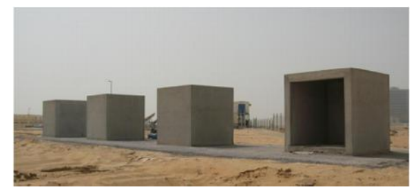
Figure 1. Solar Calorimeter installed at RAKRIC, UAE

insulation materials using the exact same conditions in terms of the size of the rooms as shown in Figure 1, the AC size used and using the same location. Radhi [10] focused on buildings in Bahrain with internal load dominated and does regression analysis on the existing building.