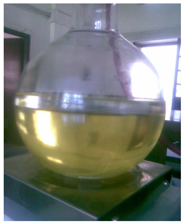
Fig. 1 Soyabean oil mixture before starting the operation

Production of bio-diesel was carried out using a bio-fuel reactor. Bio-fuel reactor contains magnetic stirrer, condenser, flask, pump and the tub. The raw material used was vegetable oil (mustard oil or refined Soyabean oil). One litre of vegetable oil along with methanol (in appropriate quantity, depending on the oil used) was mixed in the round bottom flask. Five grams of catalyst (potassium hydroxide) was added in the mixture, as shown in Fig. 1. Similarly, mixture of mustard oil is shown in Figure 2.