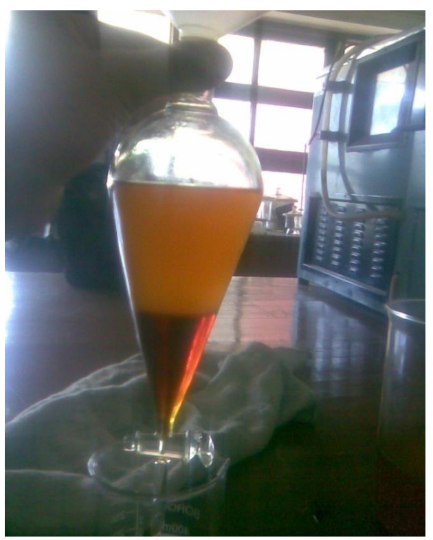
Fig. 3 Upper layer of bio-fuel and lower layer of glycerol

Meher et al. (2006) defined transesterification as the process of separating the fatty acids from their glycerol backbone to form fatty acid esters (FAE) and free glycerol. Fatty acid esters commonly known as biodiesel can be produced in batches or continuously by transesterifying triglycerides such as animal fat or vegetable oil with lower molecular weight alcohols in the presence of a base or an acid catalyst. This reaction is shown in Equation (1).