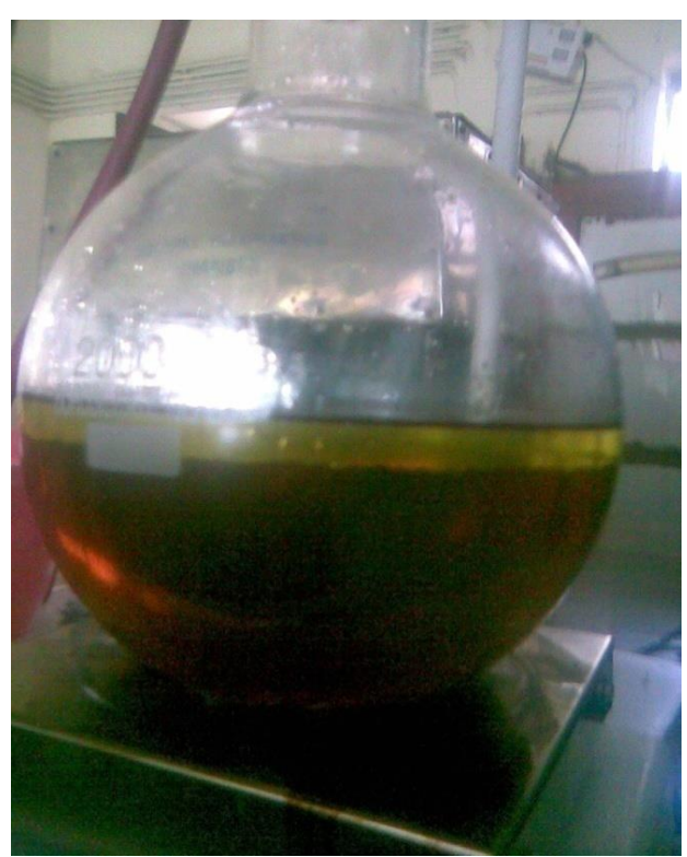
Fig. 2 Mustard oil mixture before starting the operation

The whole mixture (oil + catalyst + methanol) is heated up to the temperature of about 60 degree Celsius and is stirred at a constant r.p.m. For Soyabean oil, the whole process is allowed to run for 1 hour 30 minutes and for mustard oil the whole process is allowed to run for 1 hour 15 minutes approximately. When the process is over, the mixture is allowed to settle for at least 4 hours. Two layers are observed after settling of the mixture, the upper and the bottom layer as shown in Fig 3. The ester is visible in the upper layer and the glycerol in the bottom layer. The layers are separated using separating funnel and the glycerol is removed from the mixture. After removing glycerol from the ester, the warm water is added to the remaining part of the ester. The mixture is shaken for 4 to 5 times and mixture is then kept undisturbed for next 1 hour. Again two layers are observed, the upper layer is of bio-fuel and the lower one is of impure solution of potassium hydroxide with the water as shown in Fig. 4.