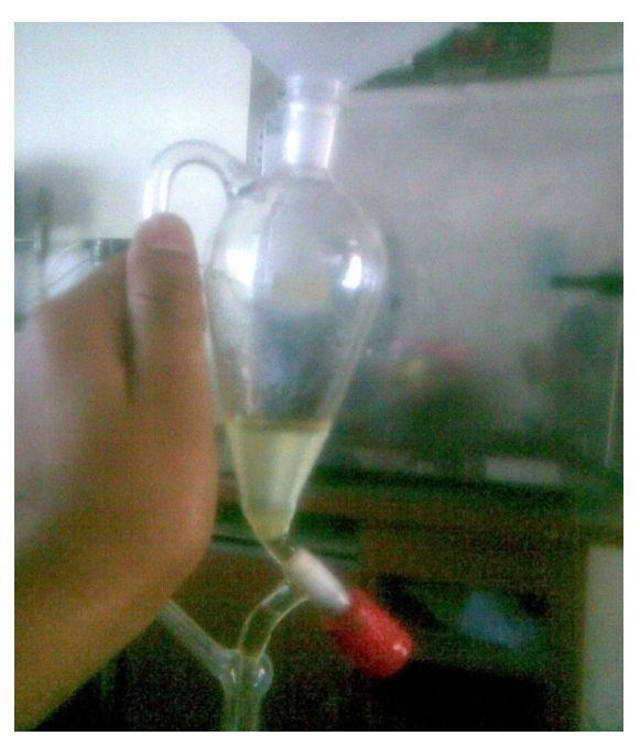
Fig. 4 Upper layer of esters and lower of potassiuhydroxide solution